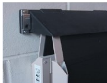
Wall Mounted Lockable Storage