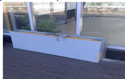
Floor Lockable Storage